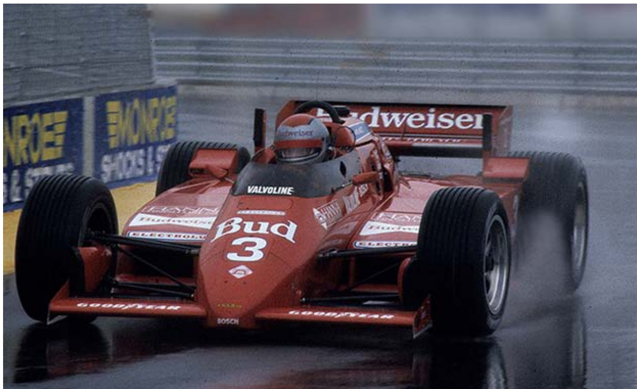
In the rain at Meadowlands.

Meanwhile Sullivan went on to win his third race of the year, beating Rahal and Michael. Mario made it home seventh while Sneva failed to finish, dropping out after 90 laps because of gearbox problems. So Andretti and Newman/Haas left Quebec with an 11-point lead over Sneva.